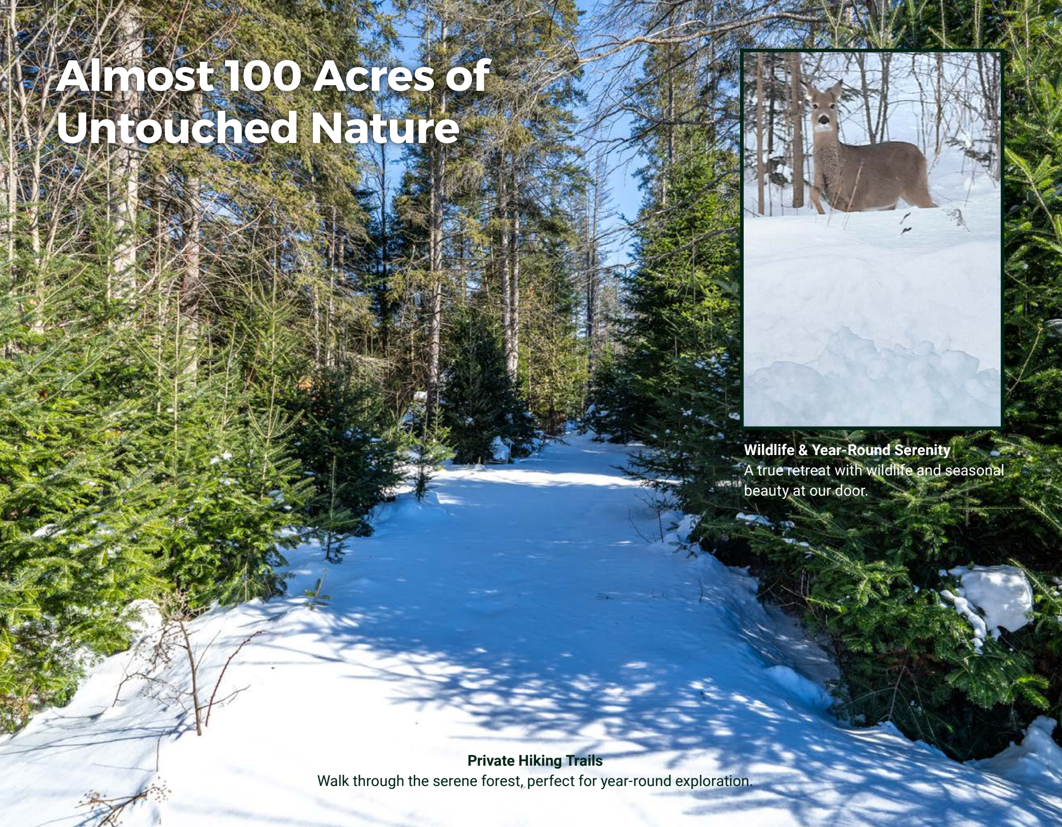
Private Hiking Trails Walk through the serene forest, perfect for year-round exploration.