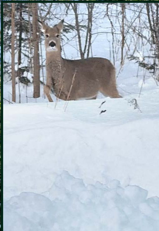
Wildlife & Year-Round Serenity A true retreat with wildlife and seasonal beauty at our door.