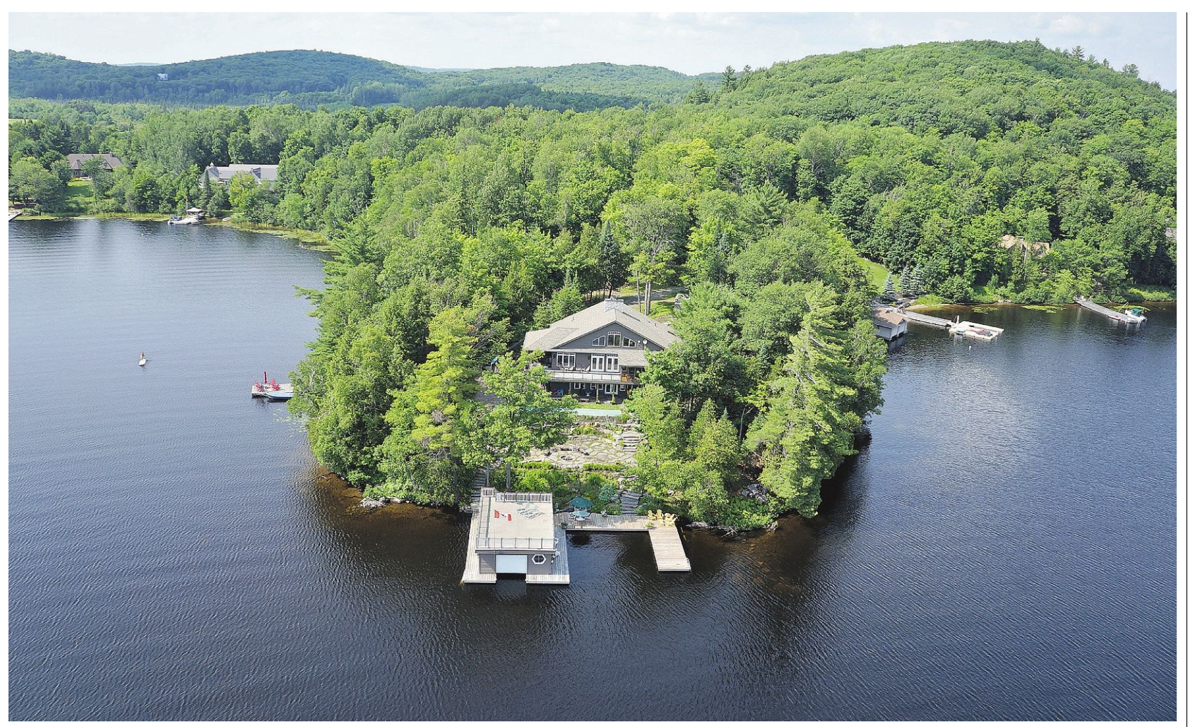
This custom-built cottage is one-of-a-kind, with features not seen in many summer homes. The property is unique, too.